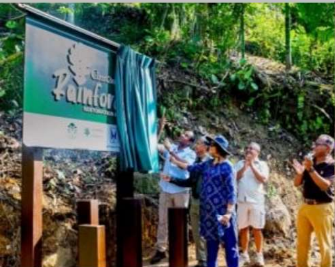
Cinnamon Rainforest Restoration