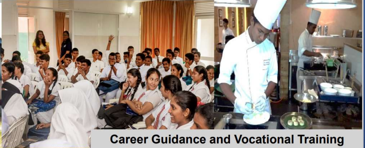
Career Guidance and Vocational Training